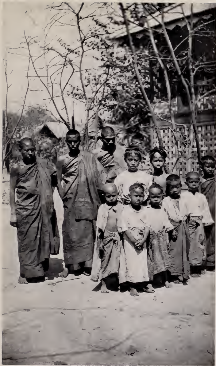
At a monastery school in Mandalay